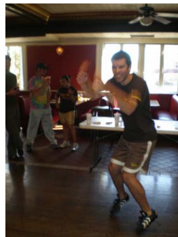
Dance Cam 1 vs. Dance Cam 2