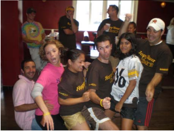
10 seconds later, this erupted into a full on gropeathon