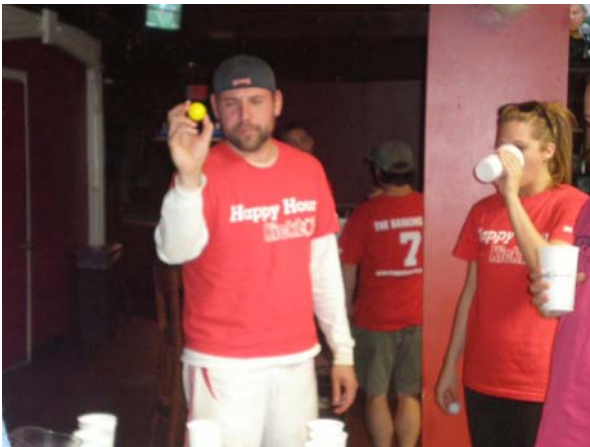
The Concentration of a Champion