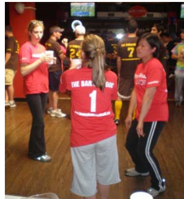
The Big O in it's favorite habitat...