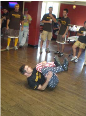
Dance Cam 1 vs. Dance Cam 2