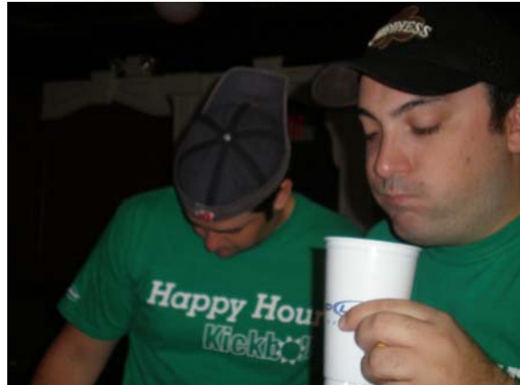
Yup...definitely gonna vomit...um-hum.