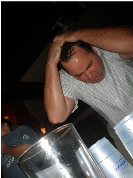
A survivor loss hurts...