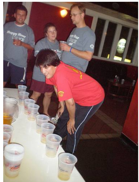
Staring contest...you win, you always do...