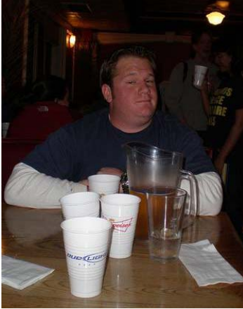
The Lawman Ledger By "Big C" Lawson