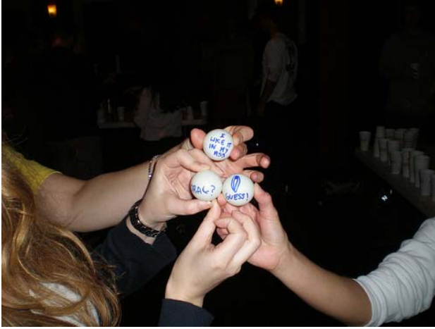
Check out my balls...