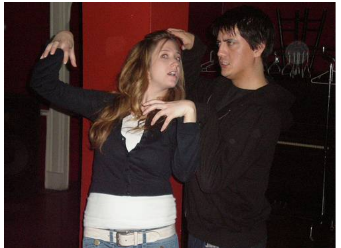
Thriller Night at the Lopez House?