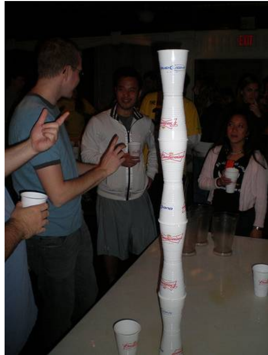
Stackable Survivor, the new game!