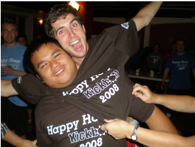
It's like Alien...that's it, it just is.