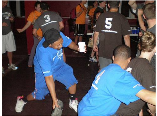
Own it, punish it, do what you want with it!