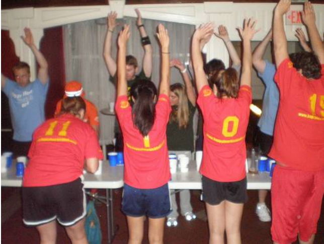
Raise your hands if you love Survivor Flip Cup!