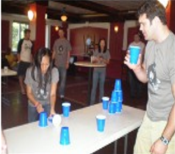
The Beer Relay circa 2007

In the past, HHKB has played and invented many drinking games, it's true, more than any other league in the entire Kickball World. Why you would be wondering or considering the outside kickball world confuses me however.