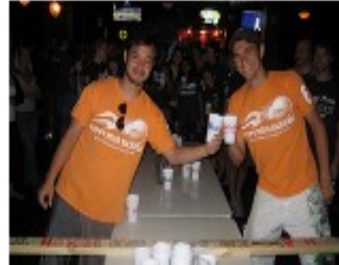
The Survivor Board of Champs

Eventually a full cup faceoff comes about and everyone smiles.