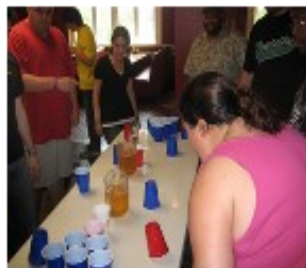
Flong Circa 2008

Then there was Flong. Flong was invented due to a lack of beer, and small cups. It combines the best of Flip Cup and Pong. You get to flip a cup and to throw a pong ball into a pyramid as well, including rebuttals, picking and pointing.