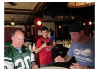
Survivor Quarters Circa 2010