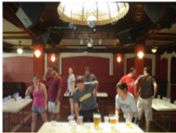
Drink-Flip-Run, circa Fall 2007

Then there was Drink Flip Run. Drink Flip Run requires four tables, and a cup for each person running around said tables at each table. You and three (or 7 if you're playing team Drink, Flip, Run) start off at different table, once the bell rings you drink your cup, flip it and then head over to the next table and do this 4 times until a winner finishes first. The first version had four total cups around the inside of each table. This was then changed to 8 as the outside of the tables were included. Finally, it was taken up another level with the inclusion of a relay race where teammates drank a cup, and tagged a waiting partner at each table, this included 4 cups per person.