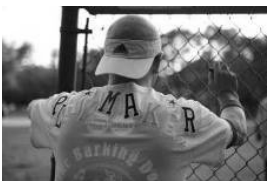
The Booty Strikes Lightning by Chip L