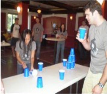
The Beer Relay

In the past, HHKB has played and invented many drinking games, it's true, more than any other league in the entire Kickball World. Why you would be wondering or considering the outside kickball world confuses me however.